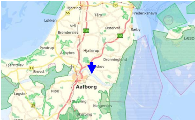
Nord-Jyllandsverket in Aalborg . The green and violet areas are designated as Natura 2000 areas.